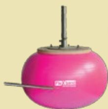
It is punctured with a sharp object