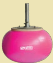
The gym ball is compressed with a static weight of 120kg