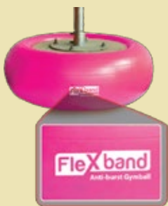
The compressed ball deflates and does not burst